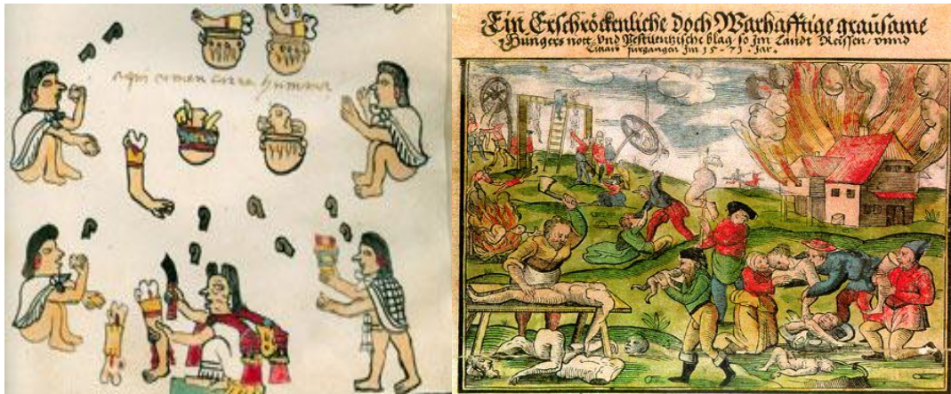
Aztec cannibalism: Codex Tudela, f. 64 Cannibalism in Muscovy (1571)

Cannibalism is represented in every medium imaginable, including fairy tales, symbols, legends, myths, histories, writings and first-hand accounts. Scientific evidence that cannibalism has been with us for a long time has been discovered by scientists in Australia, who studied the genes of female natives of Papua, New Guinea and found a resistance to “prion disease” – a brain disease linked to cannibalism that could be traced back through the mitochondria for 500,000 years (Apr 11, 2003: News in Science , www.abc.net.au/science/news/health/HealthRepublsh_828800.htm ).