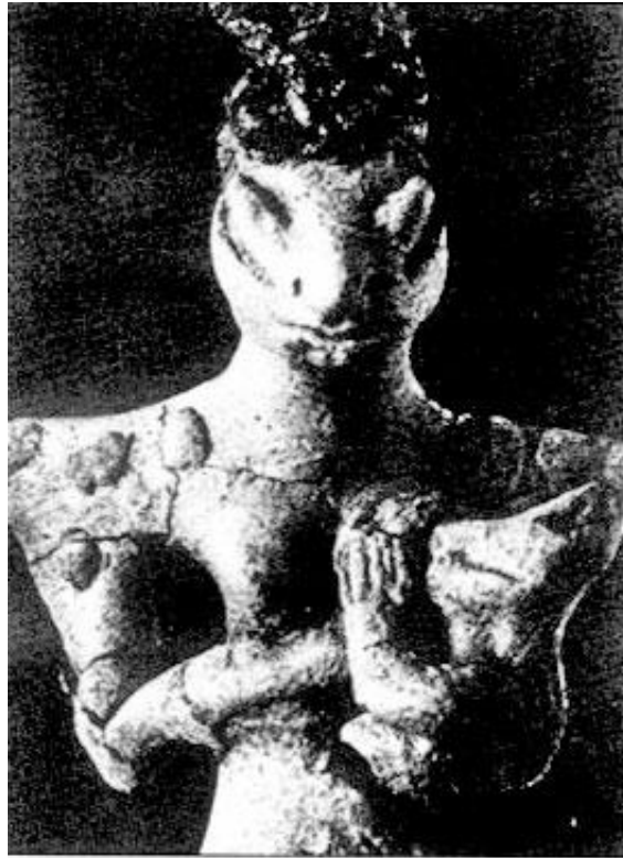
Sumerian goddess figurine from Ubaid (Mesopotamia, c. 5000 BC).

Ancient texts, myths, archeological finds, and so forth, report that ancient people believed in many gods (either good or evil), plus they believed in two races of man: the serpent race who looked like and acted like their serpent god and the humanoid race that looked like and behaved like their god.