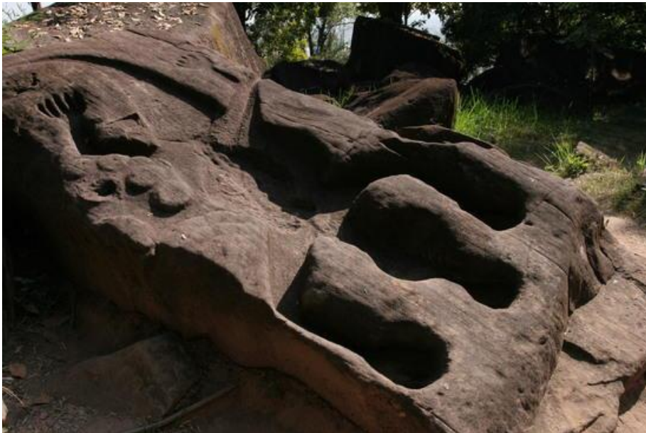
Human Sacrifice Altar Over a Thousand Years Old at Wat Phu Champasak (Laos)

"Rites of sacrifice in darkness offering the flesh for thee... Master, ruler of the underworld of fire I desire, waiting on the altar. Stars that shine, moon that hides rising behind mountains here in these lands of Carthage where Baal reigns supreme..."